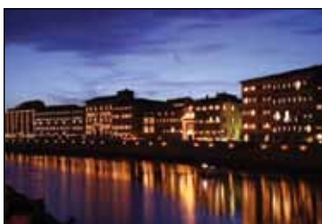
Don't miss Pisa's 2010 Luminara June 16