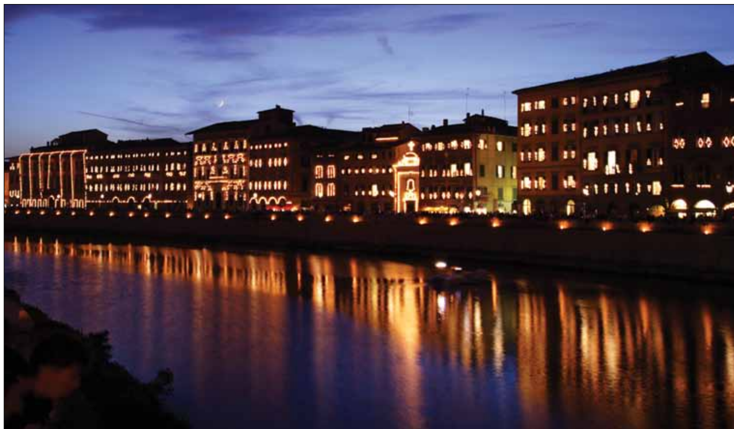
There is a fun street-level atmosphere with vendors selling local specialties of torrone (a sweet nougat with nuts), brigidini (an anise paper-thin cookie) and porchetta (a whole roasted herb pork sandwich) during the annual event.

Choir practice is at 9:30 a.m. on Sunday before Mass.