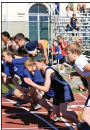
Local youth compete against athletes from throughout Italy and abroad during the 2010 CYS Sports and Fitness track meet Saturday

Students design, build own skateboards, get boarding tips from Italian pros