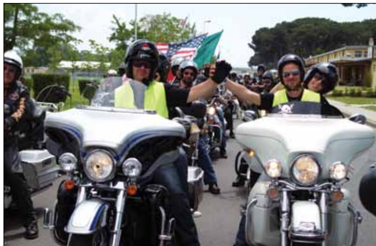
Italian and U.S. riders cruise Darby during the American stop of the Harley Chapter Livorno meeting May 22.